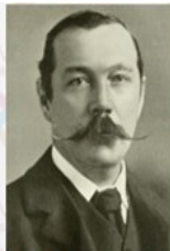
Name: Arthur Ignatius Conan Doyle Born: 22 May 1859

An influential contributor to social theory, political theory and political economy. He has been called "the most influential English-speaking philosopher of the nineteenth century".