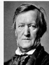
Name: Wilhelm Richard Wagner Born: 22 May 1913

Author and creator of Sherlock Holmes and Professor Challenger